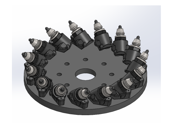
Rotary Plate with Standard Carbide Tools