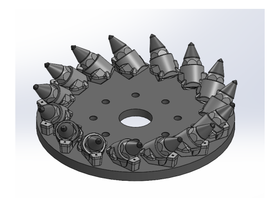
Rotary Plate with PCD Diamond Tools