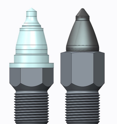
Standard Carbide Tool and Threaded Insert

Keystone Engineering's D-540 PCD tool can easily be adapted to any quick-change grinding system. Interchangeable insert allows operators to easily change from carbide tools to diamond tools.