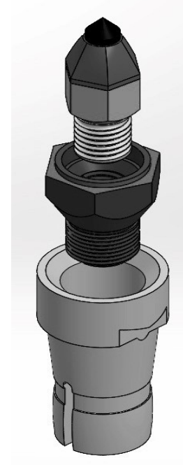
EZ303 Tool Holder with D540-875 PCD Tool and Replaceable Insert