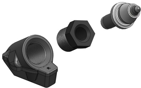
Easy Screw Quick Change System