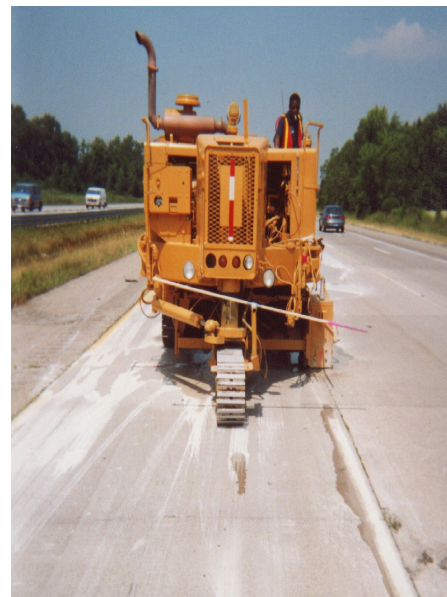
V-head drum technology can be adapted to existing grinding equipment