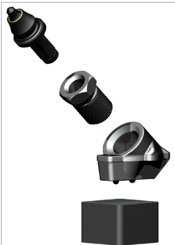
Easy Screw QC System