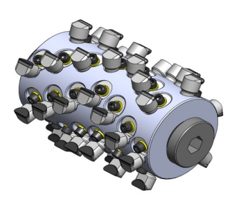
7"+ diameter drum for walk behind grinding machines